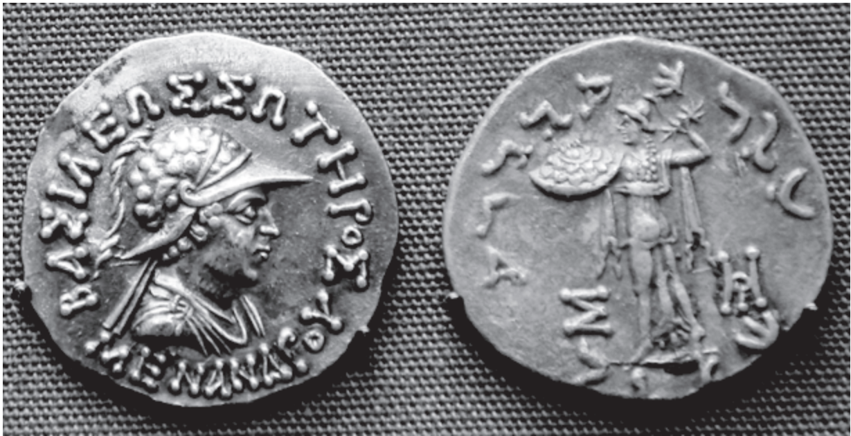
Bilingual silver drachm of Menander I, king of the Indo-Greek Kingdom, 160–135 B.C.E.

Questions 4–7 refer to the image below. Note that the front side of the coin (left) contains Greek writing; the reverse side contains writing in an Indian language. The reverse side (right) shows Athena advancing left, with a thunderbolt and shield.