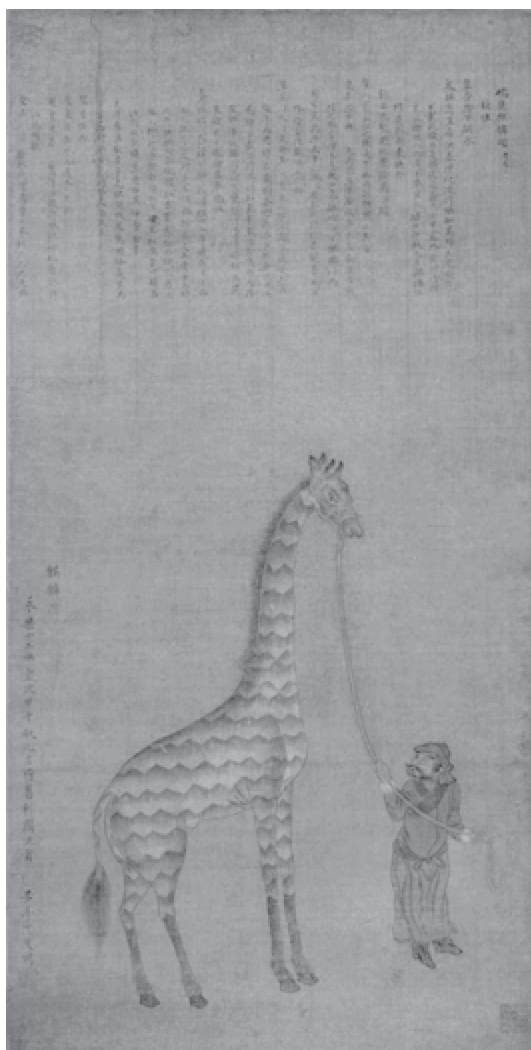
Shen Du, Tribute Giraffe with Attendant , 1414 C.E.